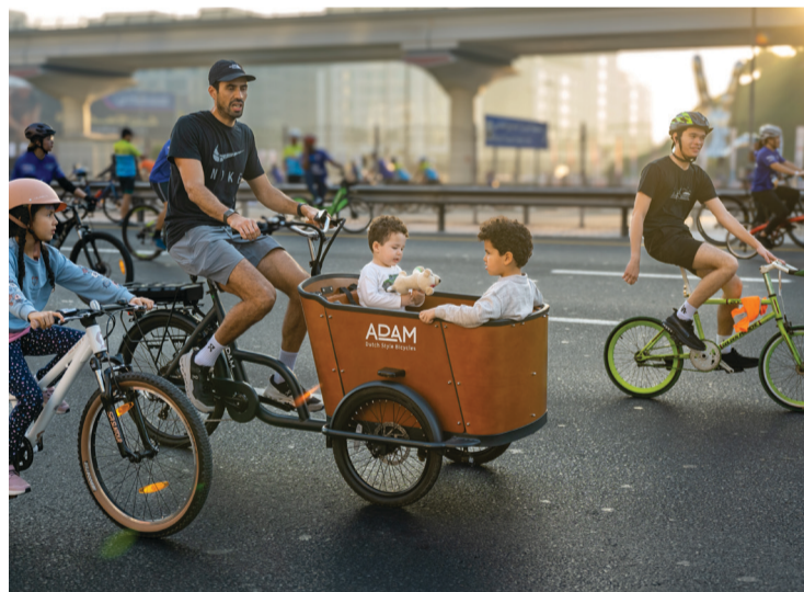
It was babies' day out at the Dubai Ride on Sunday morning. Some were seen in trailers while others rode behind their parents.

"We picked the 4km route so that we can cycle past all the major landmarks."